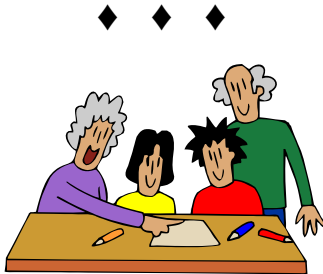
Excerpt from the National PTA's Web site, online at http://www.pta.org

If you are interested in helping out in some way or joining a committee, please contact the Committee Chair. If you have any questions about what we do, or what you could do, please contact one of your Carrolltowne PTA officers.